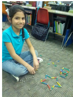
Mrs. Master's Math Moments Class creating geometric shapes with some magnetic science applications!