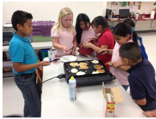
Measuring out the ingredients